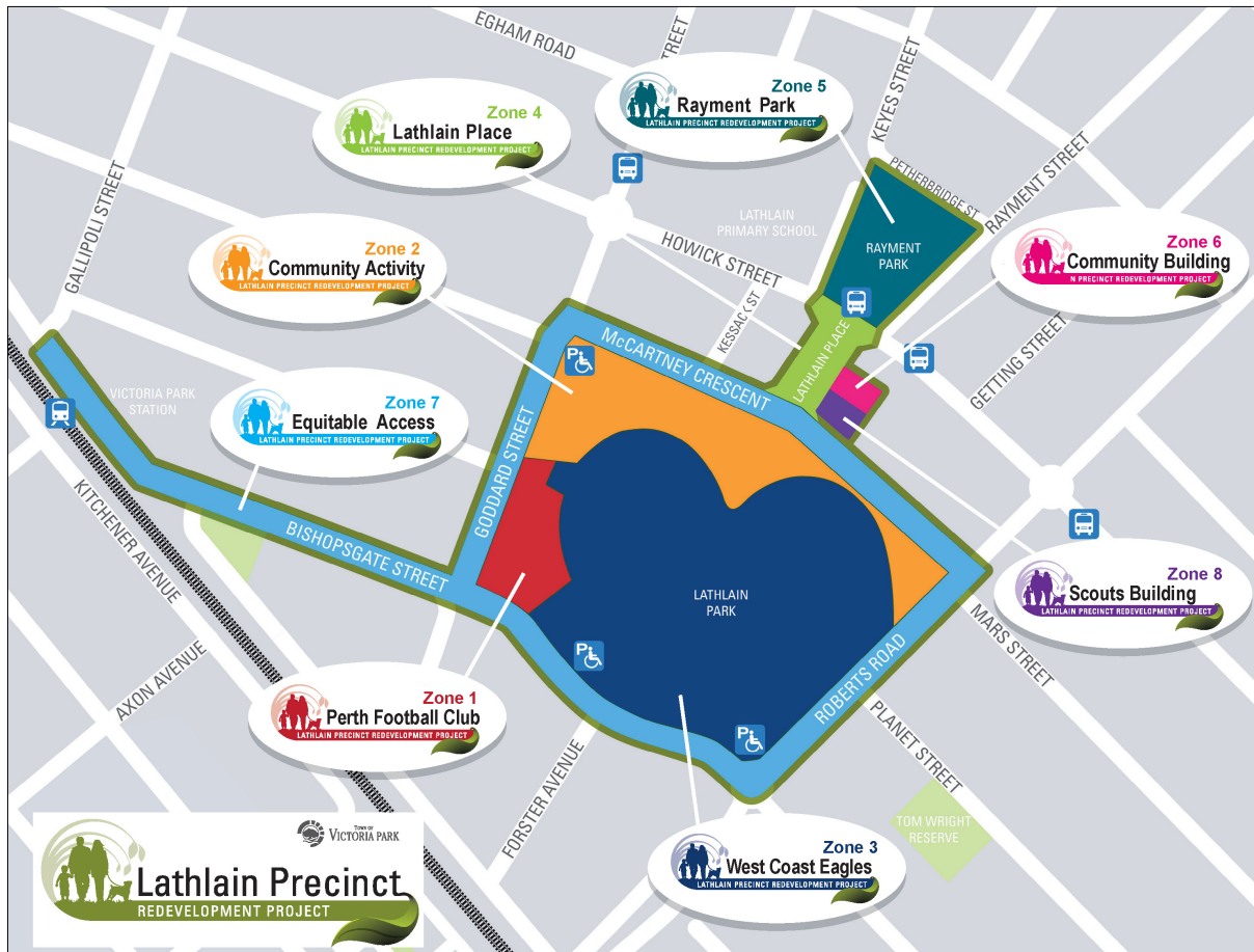
Figure 1 – Lathlain Precinct Redevelopment Project Zones